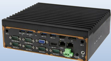
Engineering sample for reference